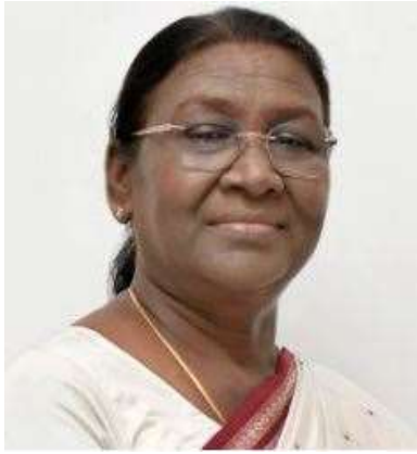
Smt. Droupadi Murmu Hon'ble President of India